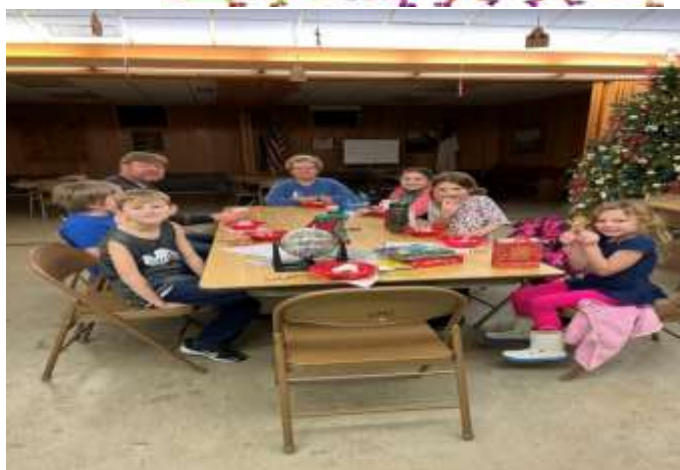
Our Sunday School Kids are enjoying a special treat

after learning the reason why we Celebrate Christmas.